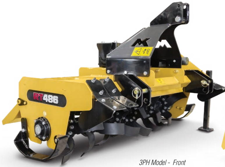
3PH Model - Front