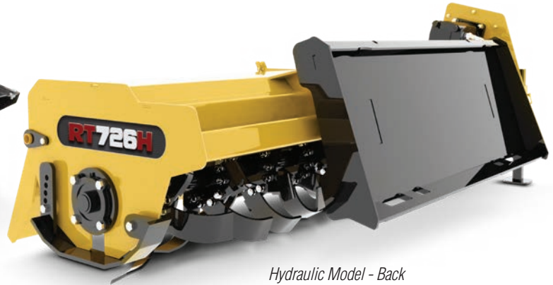
Hydraulic Model - Back

Prepare your seedbed or garden for planting using MK Martin Rotary Tillers. The tines are configured in a spiral pattern providing optimal performance and better overall processing of the soil. For lower horsepower or compact tractors this equates to increased efficiency while loosening soil for a variety of applications.